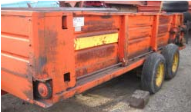
MIXMSTR#4107 12/18 Used Farm Hand Trailer Pull Manure Spreader 145-A. 6' wide x 15' long. ..... $4,500.00