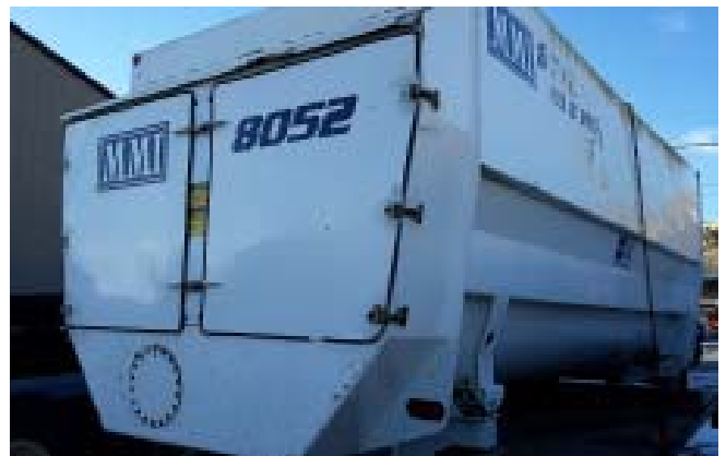
MIX16SU#6070 12/18 MM18052 4-auger Mixer Box Only. Passenger side bottom auger is new. Flighting on the other 3-augers is 50%. Box is hydrostac drive w/electric over hydraulic power for the door & spout. Gravity discharge .....$70,000.00