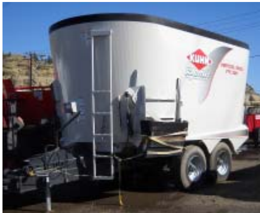
MIXIT#6018 8/16 VTC 1120 Trailer Vertical Mixer with side gravity discharge. Door left & rear SS liner, 30" w/1000 RPM, 1 3/8 - 21 tooth spline .....$107,000.00