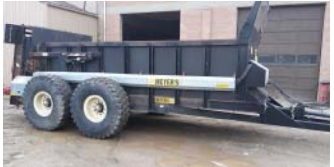
MIXMST6064 10/18 Myers VB 750 Vertical Beater Manure Spreader. Trailer pull with a plastic floor and a hydraulic slop gate. Needs a 200HP tractor. SN#30VB75011 ..... $37,500.00