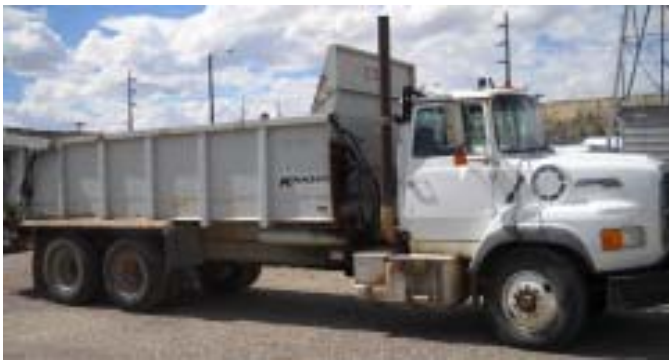
MIXMSU#6041 9/16 Kuhn 1170 Manure Spreader mounted on 1989 Ford L9000 truck ..... $45,000.00