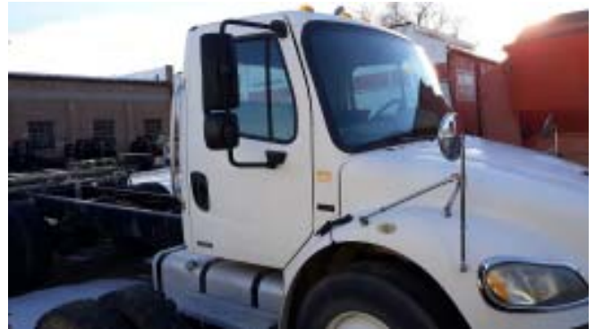
MIXMSTR#4127 12/18 2004 Freightliner Truck w/Mercedes-Benz diesel engine. Has a 3060P Allison tranny w/2-speed secondary transmission. 23,000 GVW. VIN#1FVACKCS65HN93832 .....$27,000.00