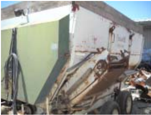
MIXIOSU#6003 5/14 Schwartz Model 850 Trailer, 3-auger w/chain & flat discharge, 540 PTO, auger reflighted .....$10,000.00