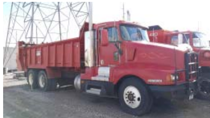
MIXMS#6062 10/18 XHD 20 Morlang Manure Spreader. Horizontal 2 beater with a plastic floor. Mounted on a 1993 Kenworth T600. Vin #1XKADR9X3PJ596419 ..... $65,000.00