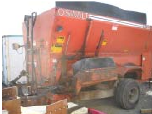
MIX14TU#6049 5/17 Oswalt 400 trailer pull Mixer with DigiStar Scale. 4-auger mixer w/re-conditioned chain discharge. .....$20,000.00